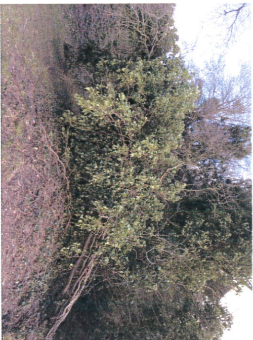
4. Wind blown Hawthorn on Cricket Pitch; has been felled and made safe.