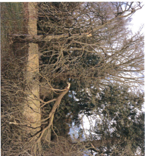
1. Churchyard – Sycamore blown out top – safe but over grave stone. Quote: