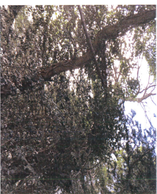
5. Leaning Cherry ¾ way up into Green Lane (steep part on the left. Undisturbed by recent storm by needs felling soon. Quote: