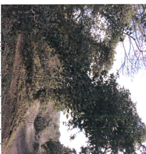
3. Wind blown Cherry by triangle – has been felled & made safe.