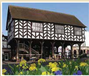
THE MARKET HOUSE