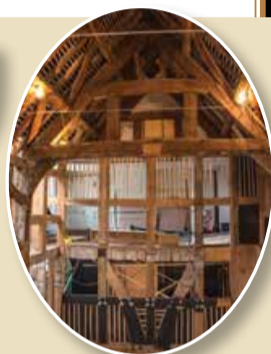
Right: THE GREAT HALL, IN THE MASTER'S HOUSE DURING RESTORATION

The Old Grammar School Heritage Centre in Church Lane dates from the early 1500s and is now a museum of Ledbury's architectural heritage.