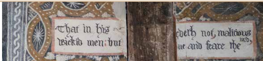
THE PAINTED ROOM