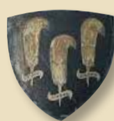
Above: THE FEATHER'S HOTEL