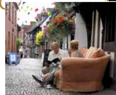
The Poetry Festival's 'Hospitality Suite'.