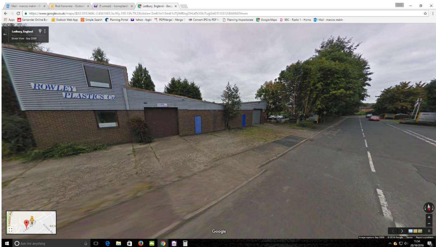
Location of hot food vending van. Lower Road Industrial Estate.